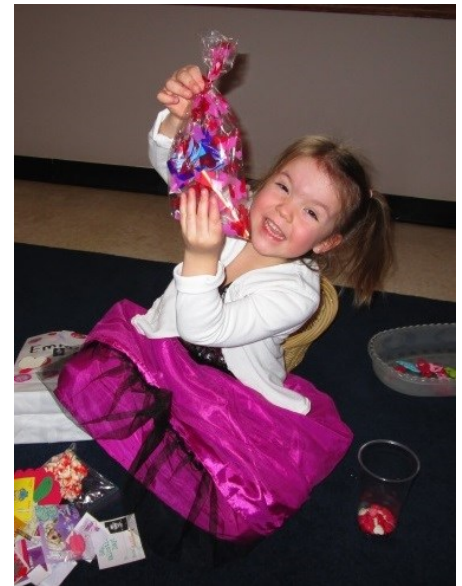
Wee Grow Valentine Celebrations